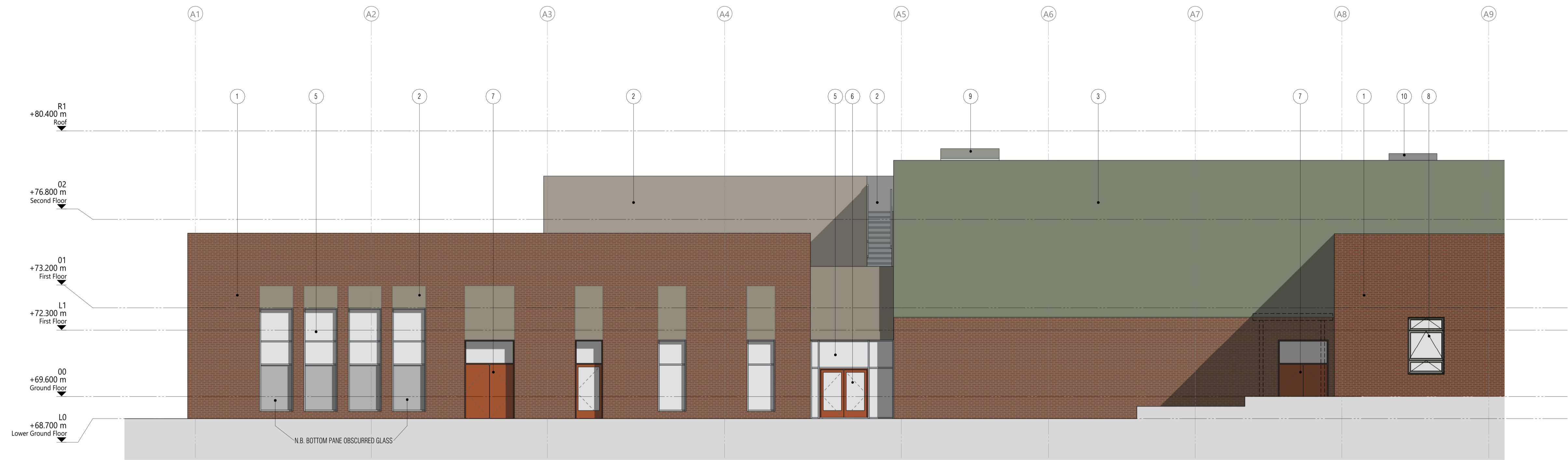
1 1:100 GA Elevations - Sports Block East 1/2