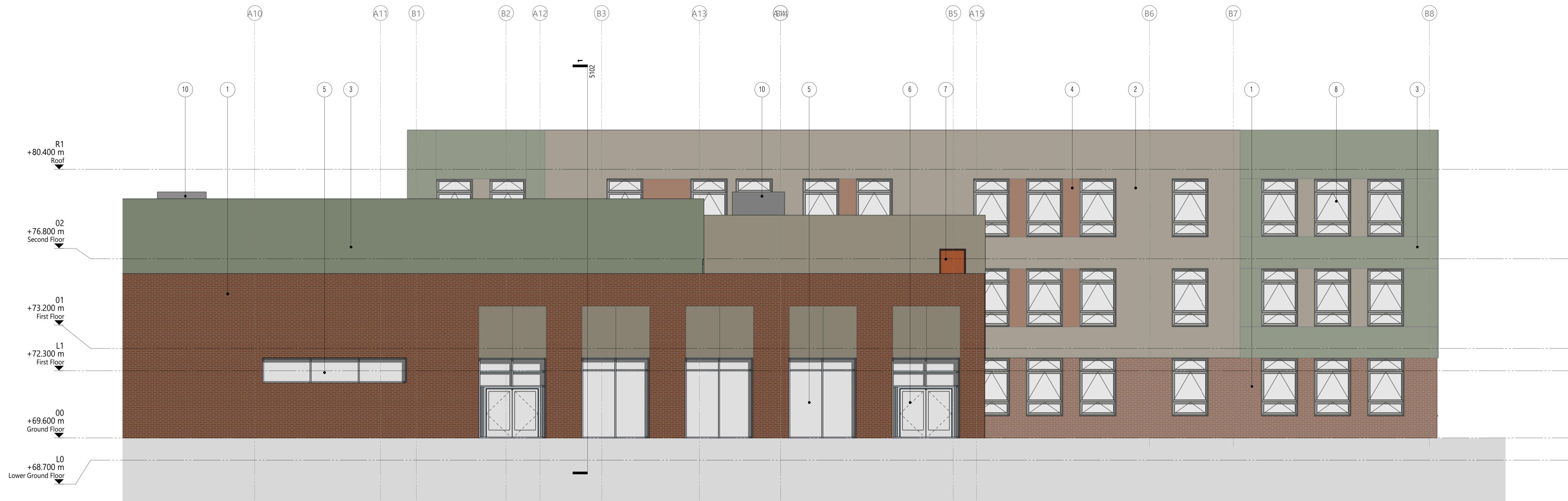
2 1:100 GA Elevations - Sports Block East 2/2