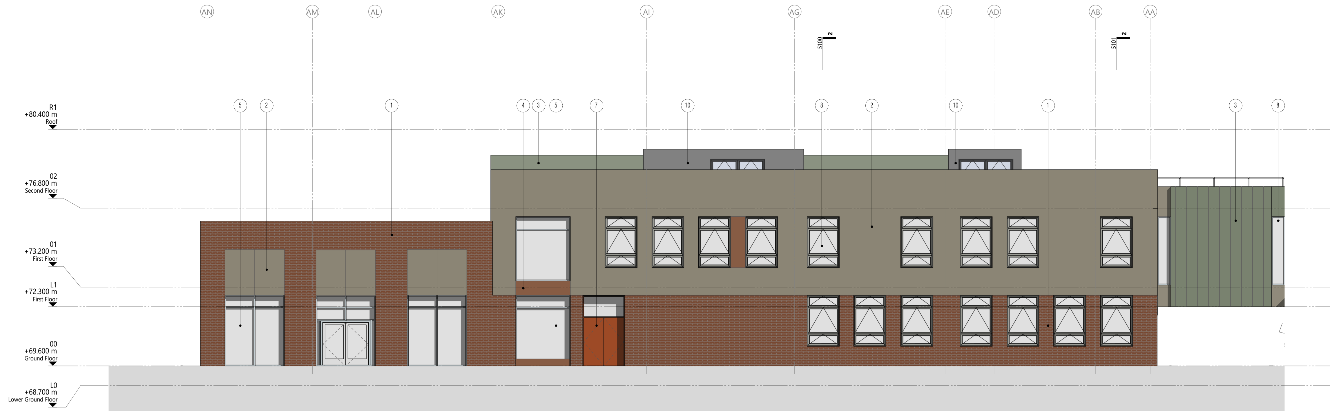
1 1:100 | Reference 2100 / 1 GA Elevations - Sports Block North