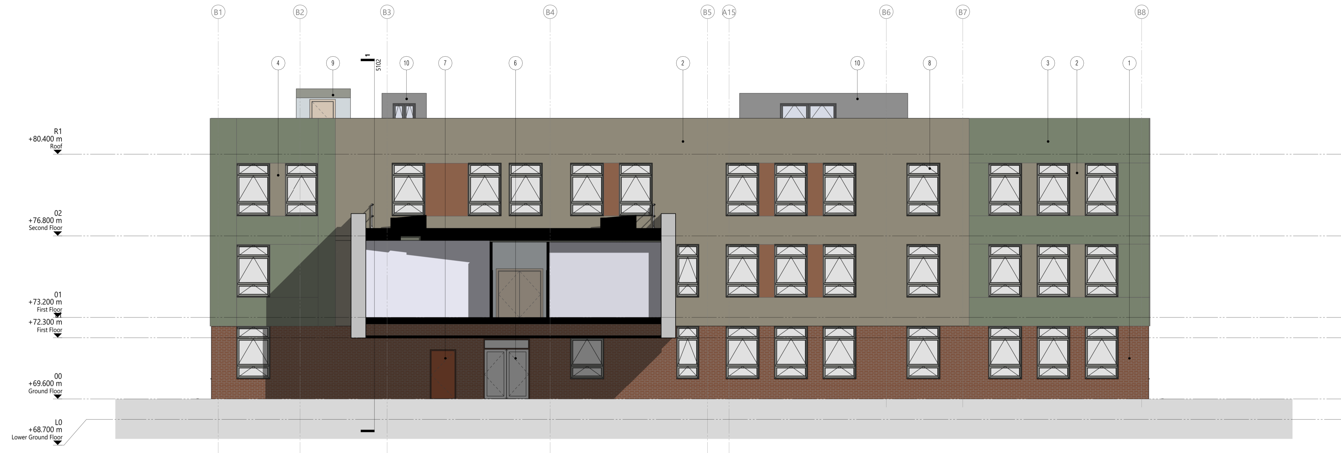
1 1:100 | Reference 2100 / 1 GA Elevations - Teaching Block East