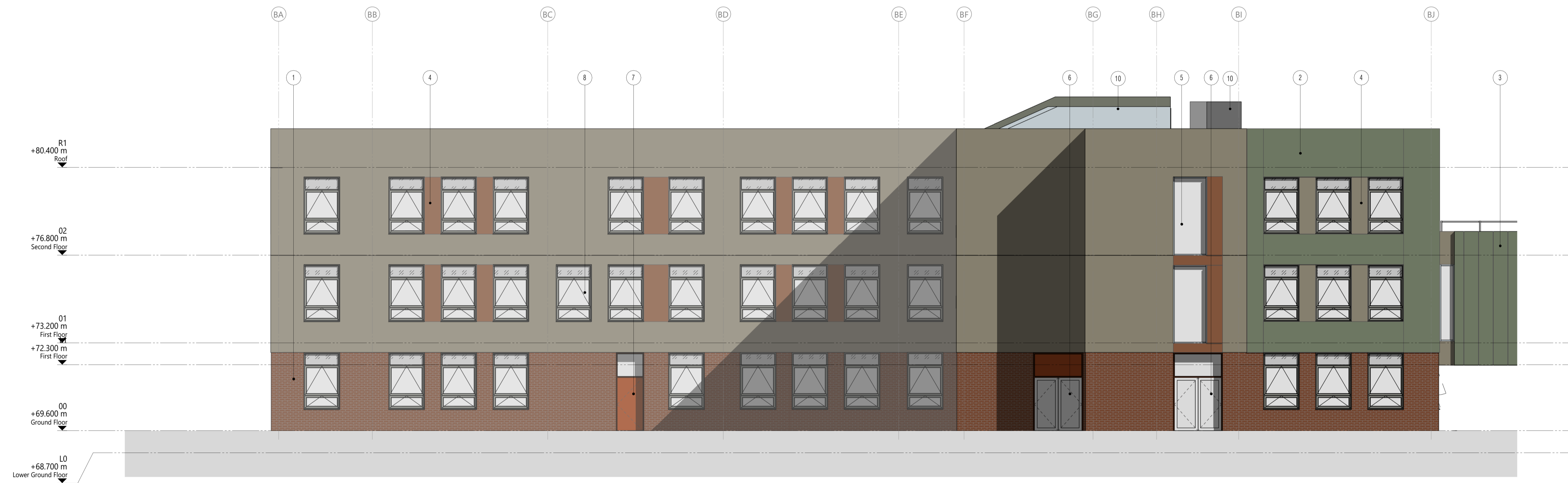
2 1:100 | Reference 2100 / 1 GA Elevations - Teaching Block South