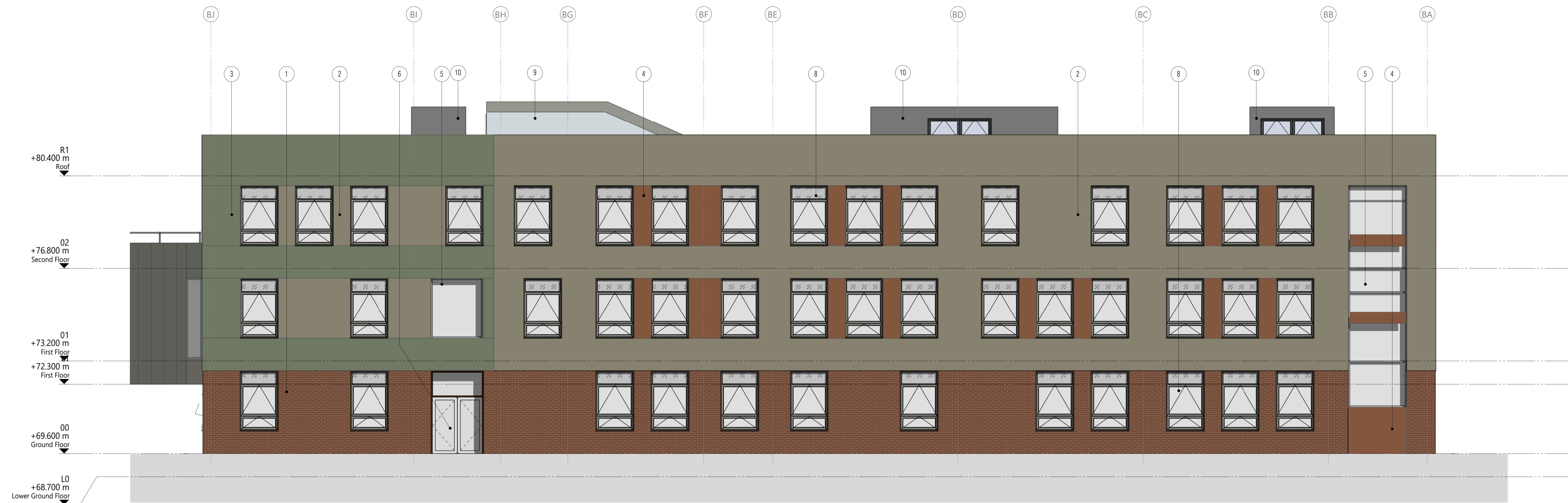
1 1:100 | Reference 2100 / 1 GA Elevations - Teaching Block North