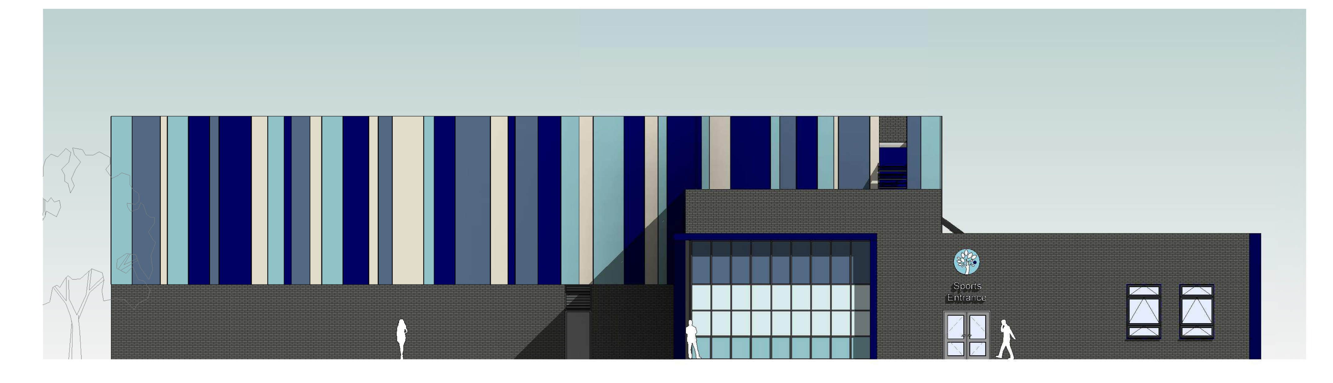
Proposed Sports Block Building Elevation East 1:100