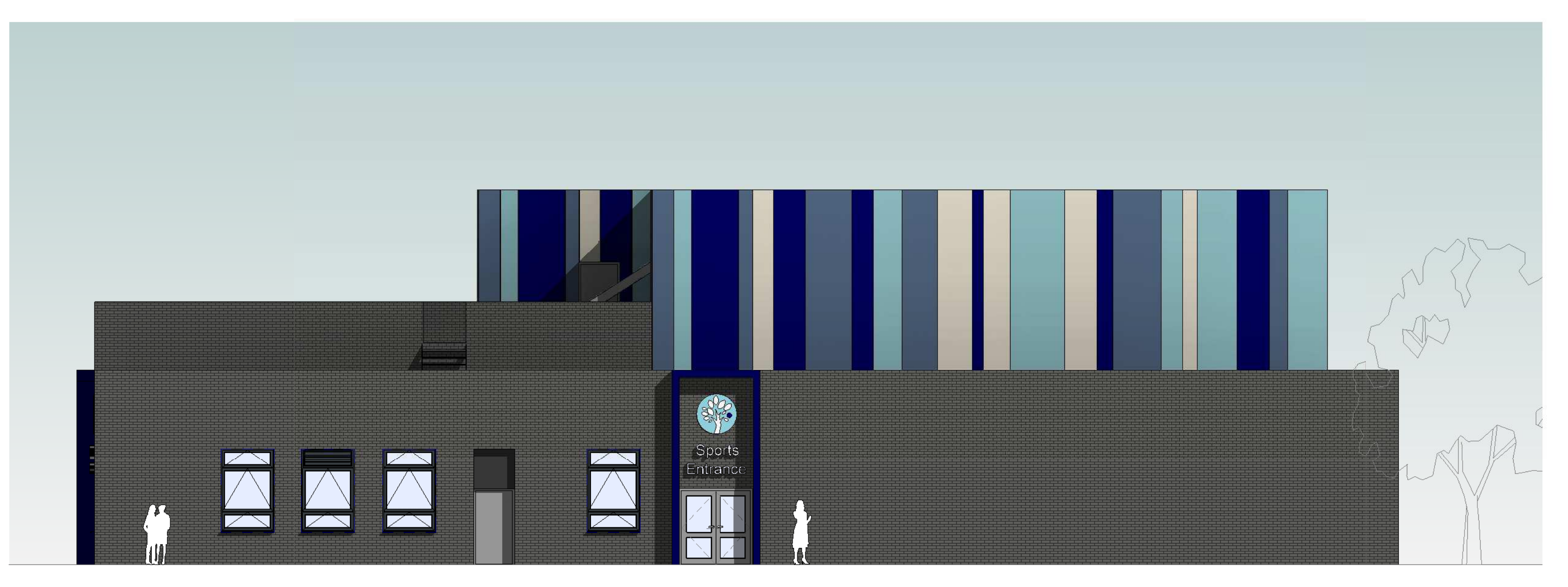
Proposed Sports Block Building Elevation North 1:100