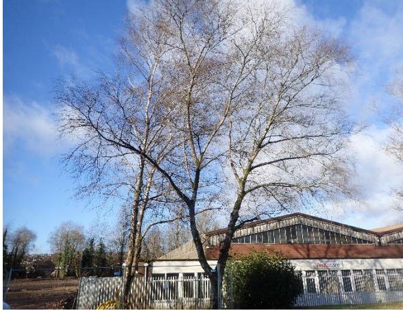
Tree ID#T394 + T393