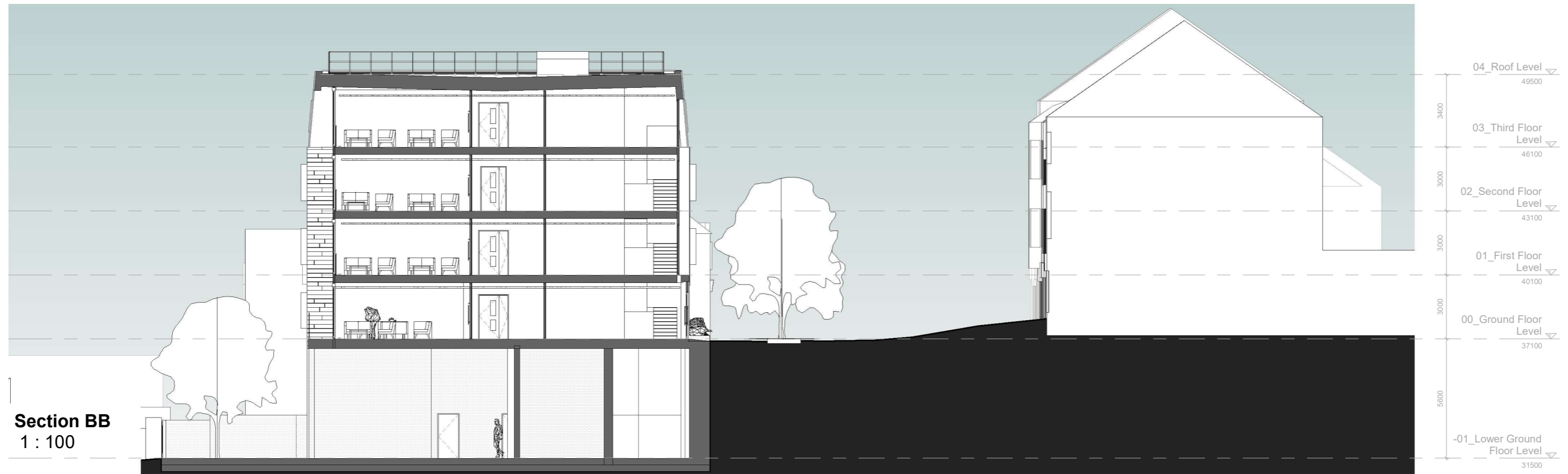
Section BB 1 : 100