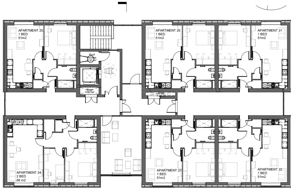
Third Floor Plan 1 : 100